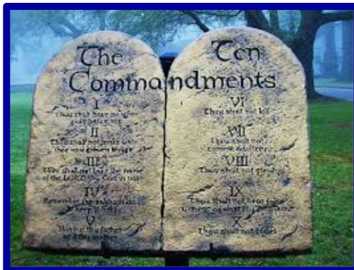
Ex 31:18 -- "tables" H3871