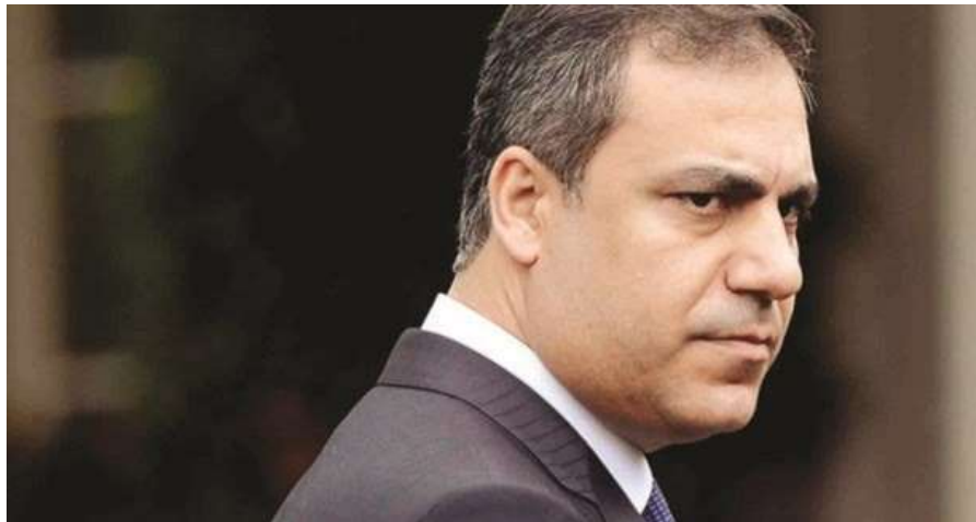
Hakan Fidan, head of Turkey's National Intelligence Organisation (MIT)

IHH's chief benefactor in the Turkish government was Hakan Fidan, who had headed TIKA from 2003 to 2007. A former Turkish military officer, he became Undersecretary to the Prime Minister in 2007. Since 2010, he has been the head of Turkish state and intelligence agency MIT.