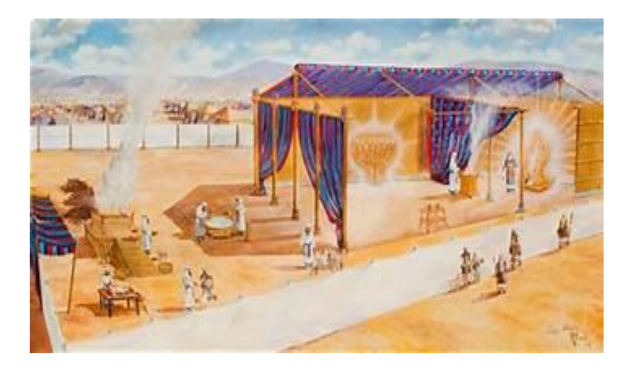
Bring All Your Sins to The Sanctuary